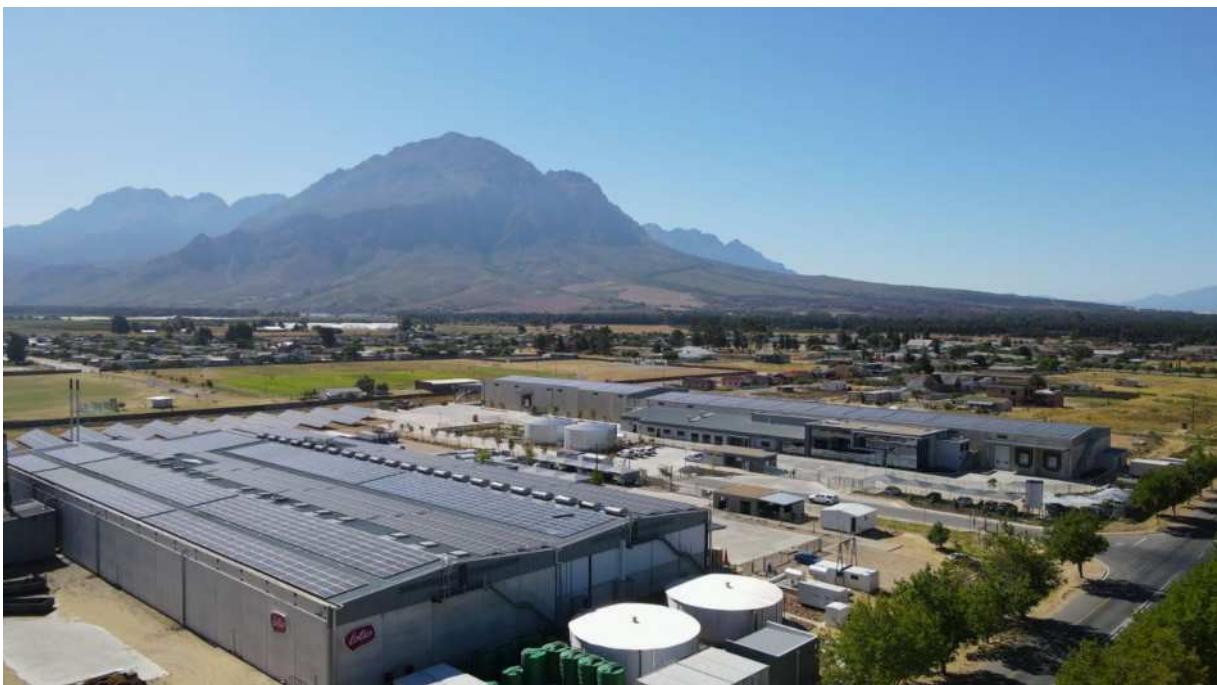
Lotus Bakeries production site, Wolseley, South Africa